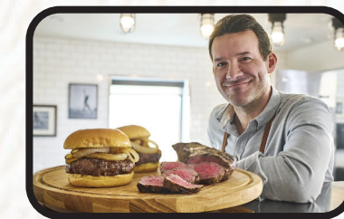
Beef scored points this summer with new spokesperson, Tony Romo. The former professional football quarterback and current sports commentator shared his family's passion for beef with consumers,

and promoted beef nationwide through digital and social media, outdoor advertising, on ESPN.com and through broadcast television ads on the Food Network, HGTV and the Magnolia Network. State beef councils extended this national programming through billboards, displays, advertising and other promotional efforts. Tony Romo's Playbook on BeefIt'sWhatsForDinner.com also highlighted new recipes and valuable information about beef's taste, nutrition, versatility and sustainability.